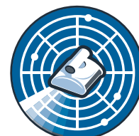
CleaverClean scanning system